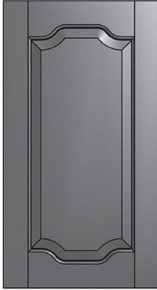
RP330 Minimum Width: 8" Minimum Height: 11"