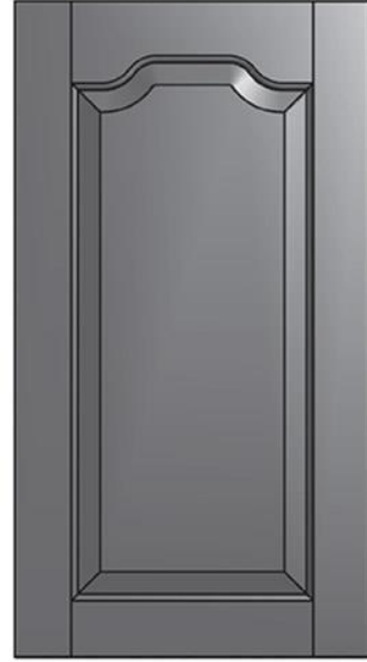
RP230 Minimum Width: 8" Minimum Height: 10"