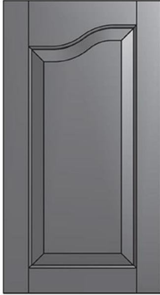
RP220 R/L Minimum Width: 8" Minimum Height: 11" Please Specify Right or Left