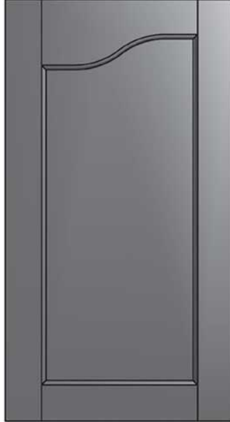
FP220 R/L Minimum Width: 8" Minimum Height: 8" Please Specify Right or Left